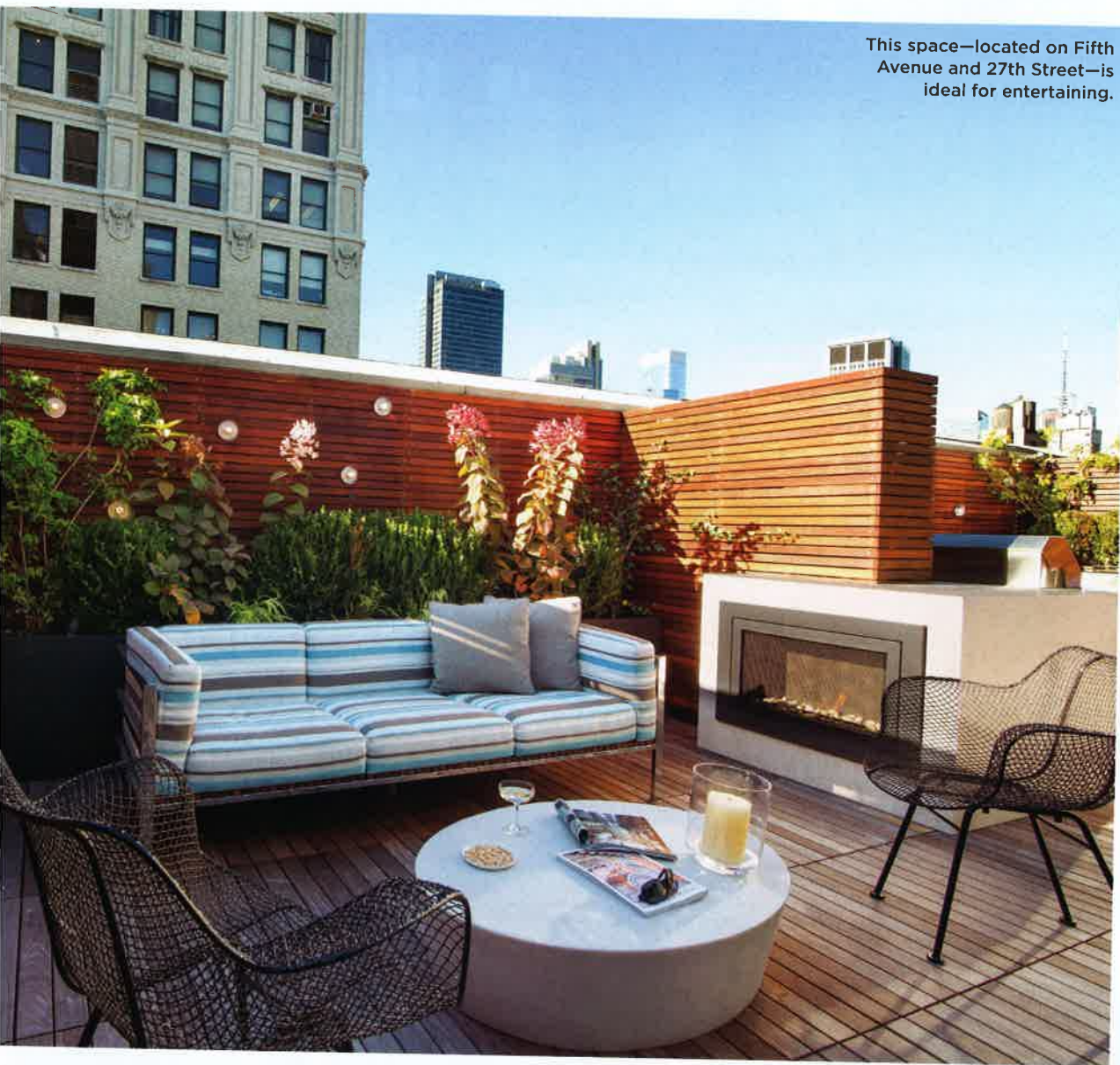
This space—located on Fifth Avenue and 27th Street—is ideal for entertaining.